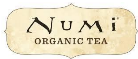
A key vendor in the organic tea market according to World Tea News